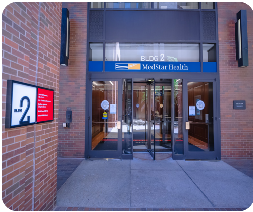
Lafayette Centre Building 2 lobby entrance from the courtyard

Our MedStar Radiology Network offers services on the 8th floor of Building 2. These services include 3D mammography, CT, cardiac calcium scoring, DEXA, ultrasound, and X-ray. If you are in need of an MRI, this service is offered at the MedStar Health Orthopaedic and Sports Center, located in Level A of Building 1 South.