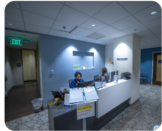
Radiology check-in desk on the 8th floor of Building 2